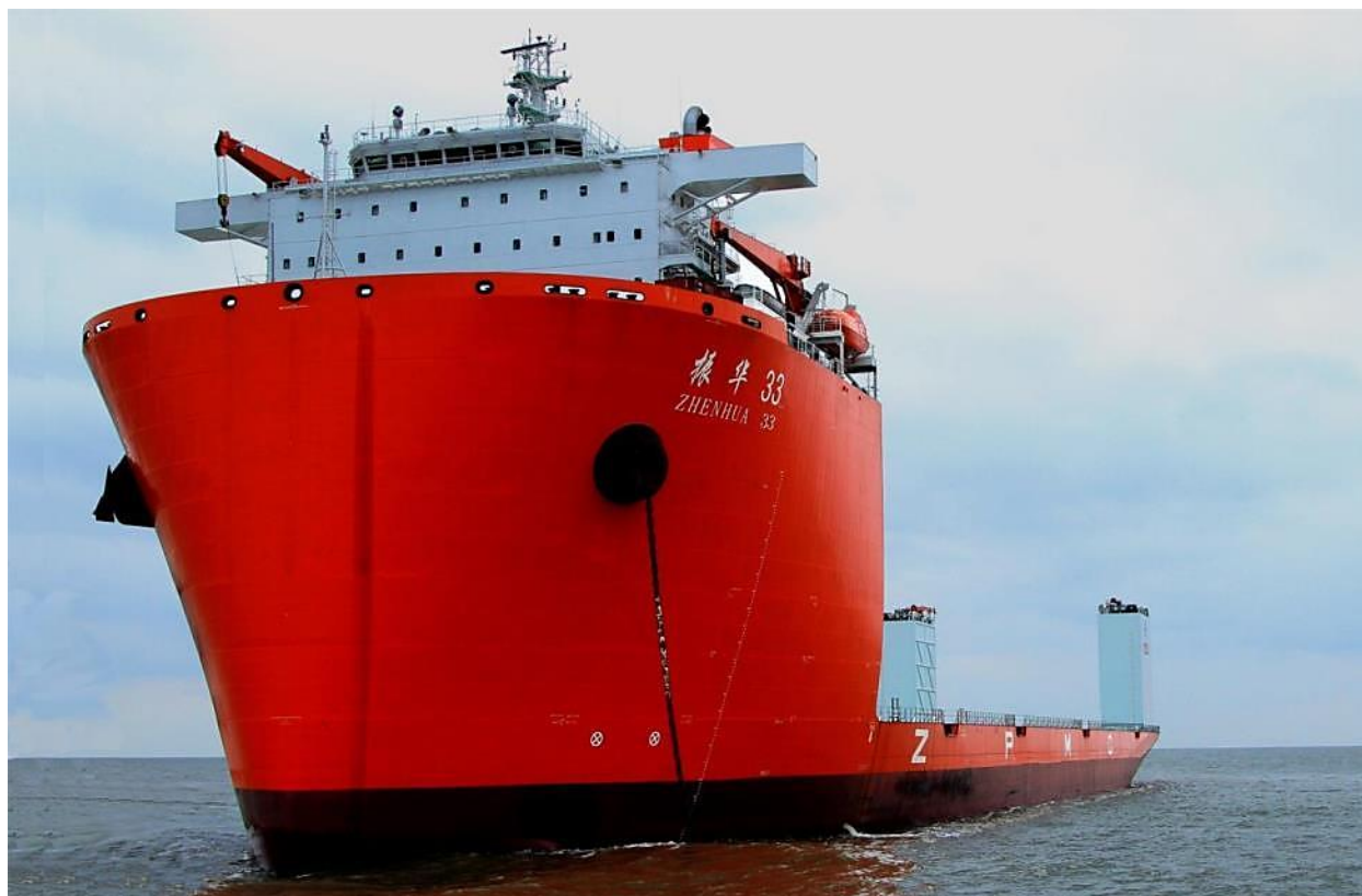
The ZOMC operated ZHEN HUA 33

The ZHEN HUA 33 is an Ice Class B self-propelled semi-submersible transportation and float-over installation vessel. Without its aft buoyancy casings, it has a free deck area of 185 x 43 m, making the ZHEN HUA 33 the longest vessel in its class. It is constructed with a reinforced stern and equipped to submerge to 13.5 m of water over deck. A Kongsberg DP-II system is fully integrated with two tunnel thrusters at the bow and three fully-revolving main azimuth thrusters at the stern. With 19,000 kW of power, the vessel's transit speed is estimated to be 14 kn.