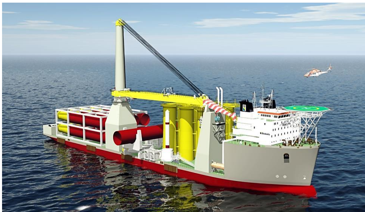
Artist impression of the new F3000 crane vessel, ex FINESSE

Boskalis also announced plans to convert its 2012 build semi-submersible heavy-lift ship FINESSE into a 3,000 t capacity crane vessel for the offshore wind farm installations and platform decommissioning market. This DP2 F3000 crane ship with accommodation for 150 persons is expected to enter the market in 2018 and start working on the DONG Energy's 1.2 GW Hornsea Project One wind farm, located 120 kilometers off the Yorkshire Coast in UK waters.