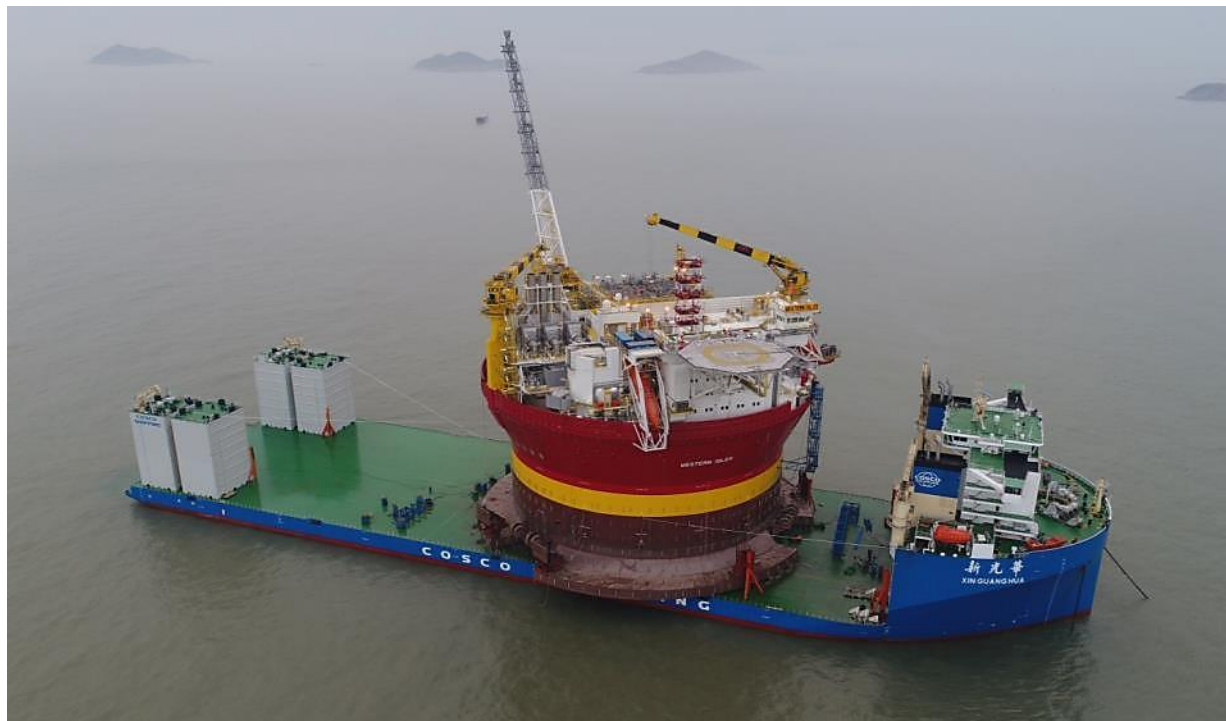
The GUNG HUA KOU with the DANA FPSO

after the DOCKWISE VANGUARD. In addition to its own heavy-lift ships, COSCO also has the 38,000 dwt XIA ZHI YUAN 6, and the 30,000 dwt HUA HAI LONG (owned by Guangzhou Salvage) under management. Both of these ships were built in 2012. As mentioned above, the HAI YANG SHI YOU 278 is currently also in the COSCO pool. With most of the COSCO vessels having DP capability, COSCO has been active in the topside float-over installation market.