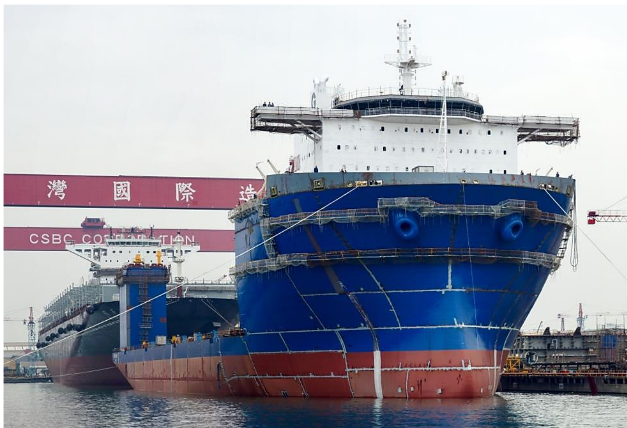
The first of four GPO heavy-lift vessels nearing completion

can still pass without any overhanging cargo through the expanded Panama Canal, with its 49.0 m maximum vessel width limit. Late June 2017, ZPMC announced that they planned to acquire 50% of PGO to further increase their semi-submersible shipping capabilities.