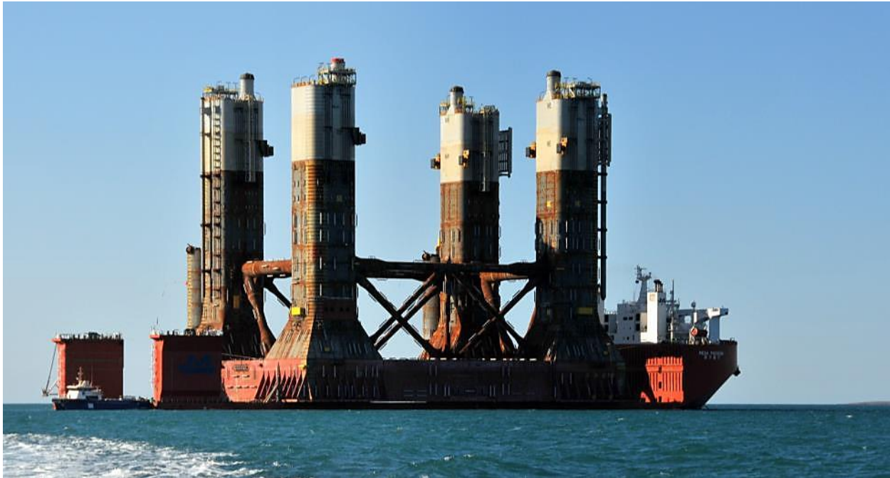
MEGA PASSION arrived in NW Australia with the Wheatstone SGS

The Chinese dredging company CCCC introduced the new build 21,200 dwt WISH WAY semi-submersible ship in 2011. This open deck ship with two movable casings on the stern looks very similar to the COSCO owned TAI AN KOU. It is mainly used for transporting the company's dredging equipment, but also ventures out into the open market.