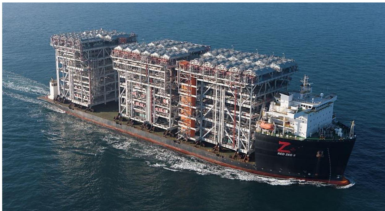
The RED ZED II with Yamal modules

In 2014, the Chinese shipbuilder Qingdao Wuchuan Heavy Industries won the order to build two 50,000 dwt semi-submersible heavy-lift ships for Hong Kong based United Faith Group. By the time these were ready for delivery in 2015, the ships, named RED ZED I and RED ZED II, were chartered to the new company ZPMC-Red Box Energy Services which focused on the energy services aspect of marine logistics for energy infrastructure projects like Yamal LNG, Ichthys LNG, and Gorgon LNG. The vessels were delivered with a single temporary stern casing, housing the engine exhaust stacks. This left the stern open for loading of large Yamal modules for which a multi-year contract was obtained. Additional shipping capacity for Yamal was provided by the 50,000 dwt semi-submersible ship HUA YANG LONG, delivered in 2016 to its owners Guangzhou Salvage and time chartered to Red Box Energy Services.